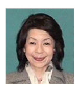
Noriko Kando National Institute of Informatics, Japan