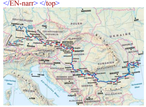
Figure 1: Danube river map

<EN-narr>Relevant documents should contain at least a short description of cities through which the rivers Danube and Rhine pass, providing evidence for it. The Danube flows through nine countries (Germany, Austria, Slovakia, Hungary, Croatia, Serbia, Bulgaria, Romania, and Ukraine). Countries along the Rhine are Liechtenstein, Austria, Germany, France, the Netherlands and Switzerland