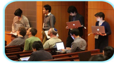
Previous NTCIR Conference