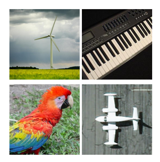
Figure 1: Examples of four target images used in the experiment. In the top left, an example of a wind farm target image like that used in tasks WIND1 and WIND2. In the top right, an example of a keyboard target image used in task INSTR. In the bottom left, an example of a bird (macaw) target used in task BIRD. In the bottom right, an example of an airplane target like that used in UAV1 and UAV2.