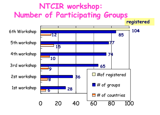
Figure 3. Number of Participating Groups

Table 2 is a list of the active participating research groups in the NTCIR-6 . A hundred and four groups from 15 different countries and areas registered, and eighty-five from twelve different countries and areas were remained as active participants to the final meeting.